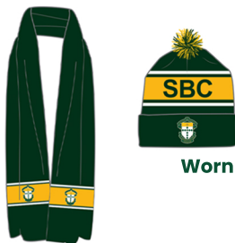
Worn Outside Only